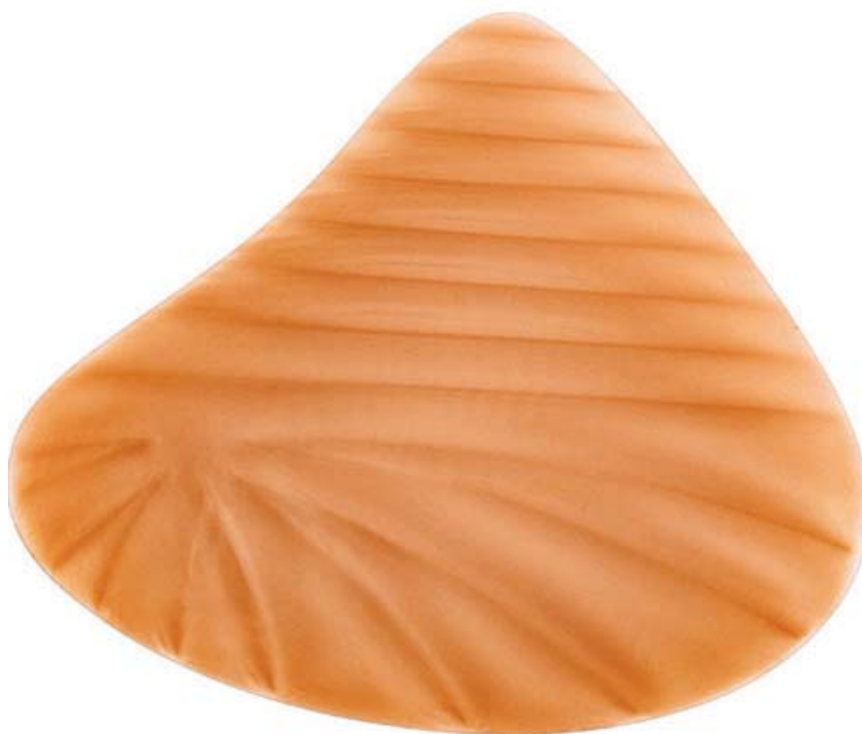
Back view of the 10225 Massage Form

Made with ABC's new Satin Skin this one of a kind breast form provides therapeutic massaging action to help stimulate lymph flow.